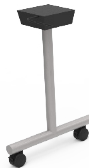
Tubular T Base

Flip mechanisms are injection molded with aluminum and steel. There is a 1 handle release for each pair of legs which is mechanically attached to the underside of the table top using #12-14 screws. The adjustable leveler is 1/4"-20x1 3/4" long shank. The single handle allows for an individual to release both mechanisms simultaneously and flip the table up and down.