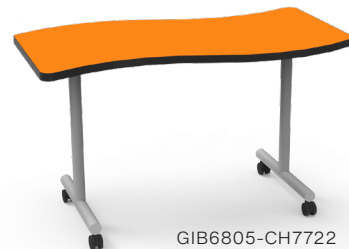
GIB6805-CH7722 Shown with optional different colored edge banding