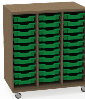
SSG0348-5AC Shown in premium finish

Overall Depth: 24" # of OPTIONAL deadbolt locks on -5AC model: 1