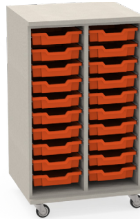
SSG0248-0AC Shown in premium finish

Overall Depth: 24" # of OPTIONAL deadbolt locks on -5AC model: 2