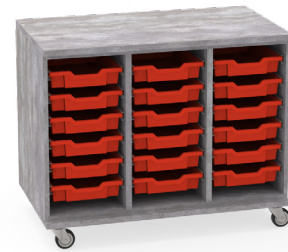
SSG0334-0AC Shown in premium finish

Overall Depth: 24" # of OPTIONAL deadbolt locks on -5AC model: 1