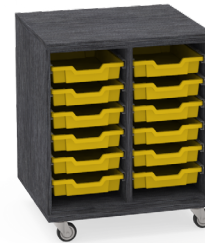
SSG0234-0AC Shown in premium finish

Overall Depth: 24" # of OPTIONAL deadbolt locks on -5AC model: 2