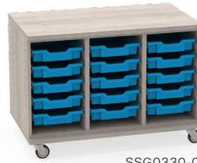
SSG0330-0AC Shown in premium finish

Overall Depth: 24" # of OPTIONAL deadbolt locks on -5AC model: 1