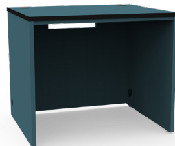
CD1010-LG Units shown in Premium finish