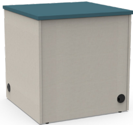
CD2010-LG Units shown in Premium finish