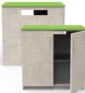
LBN1110-AL Bin not included Units shown in Premium finish

Sizes Available W: 30 or 36" H: 30 or 36" D: 22 or 29" Overall Depth: 23 or 30" # of optional locks required: 1