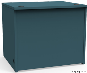
CD1000-LG Units shown in Premium finish