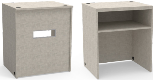
CD1012-LG Units shown in Premium finish