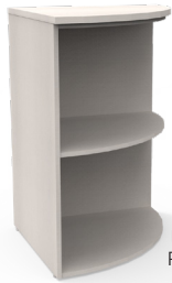
CD2000-LG Units shown in Premium finish