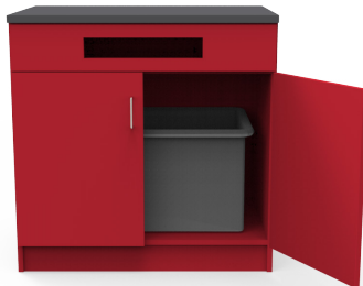
LBN1010-AL Bin not included Units shown in Premium finish