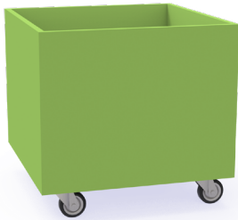
LBC1000-AC-D Unit shown in Premium finish

Pair a Depressible Book Cart with Unit CD1010-LG or CD1012