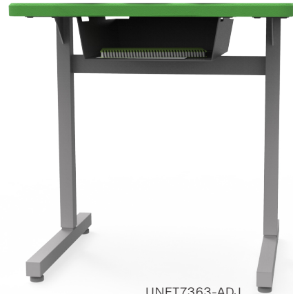
UNET7363-ADJ shown with -P16CH charcoal book box