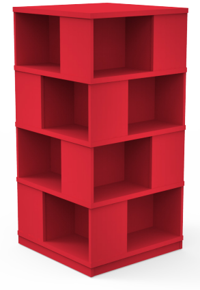
LBN4060 Unit shown in Premium finish