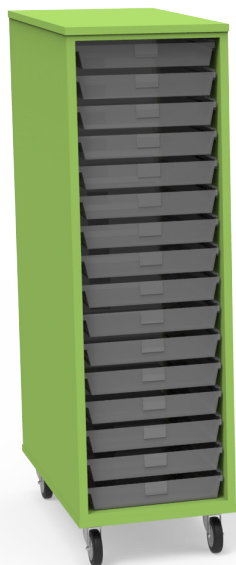
SSC0972-0AC Shown in premium finish