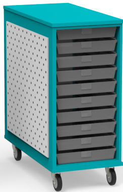
SSC0948-0AC-PB Shown in premium finish