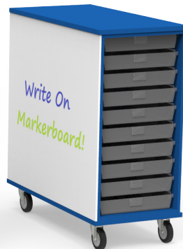
SSC0948-0AC-SB Shown in premium finish