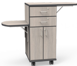
TL6900-AC Shown in premium finish