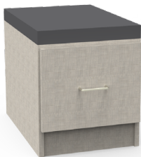
CB9204-HC Shown in Premium finish