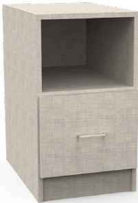
CB9203-AL Shown in Premium finish