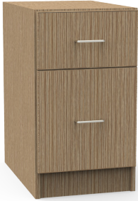
CB9201-AL Shown in Premium finish