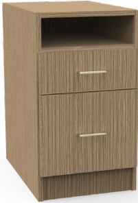
CB9202-AL Shown in Premium finish