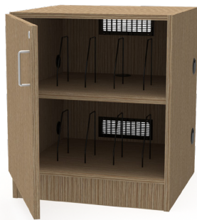
CB3020-AL Shown in Premium finish and optional lock