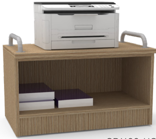
CB1100-HC Shown in premium finish Printer not included