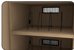
Inside View of Tablet Charging Cabinet

*Power strip to be supplied by others. Please call WB for more info. 800.242.2303